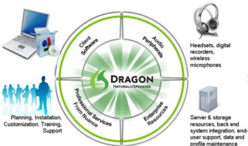
Figure 3: Components of a Dragon Enterprise Installation

Unlike most off-the-shelf speech recognition products, Dragon NaturallySpeaking Professional is an enterprise-ready application, with administrative tools for managing large user populations and securely managing voice profiles.